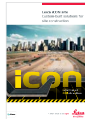
Leica iCON site Brochure