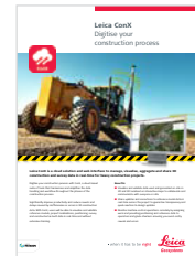
Leica ConX Flyer