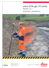
Leica iCON gps 70 Series Brochure

Illustrations, descriptions and technical data are not binding. All rights reserved. Printed in Switzerland – Copyright Leica Geosystems AG, Heerbrugg, Switzerland, 2022. 959264 en – 09.22